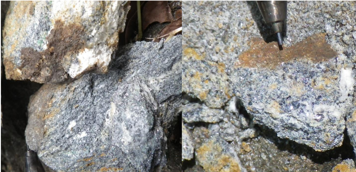
Figure 2. Close up images of the graphite-bearing quartzose schist found on exploration license 5304.

Preliminary visual comparisons suggest that the graphite mineralisation located on exploration license 5304, show a number of similar characteristics to the graphitic outcropping found at the Company's key graphite Balama North project.