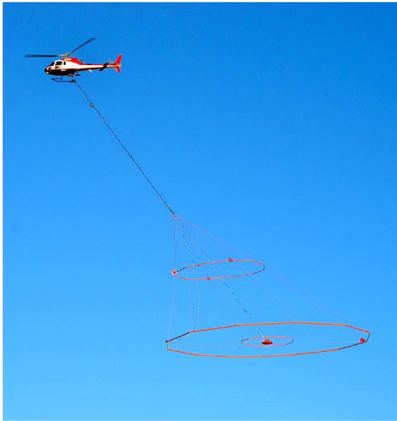
Figure 4. Example of the helicopter-borne geophysical VTEM Plus System with Magnetic Gradiometer

Triton looks forward to providing further exploration updates to the market as the information becomes available.